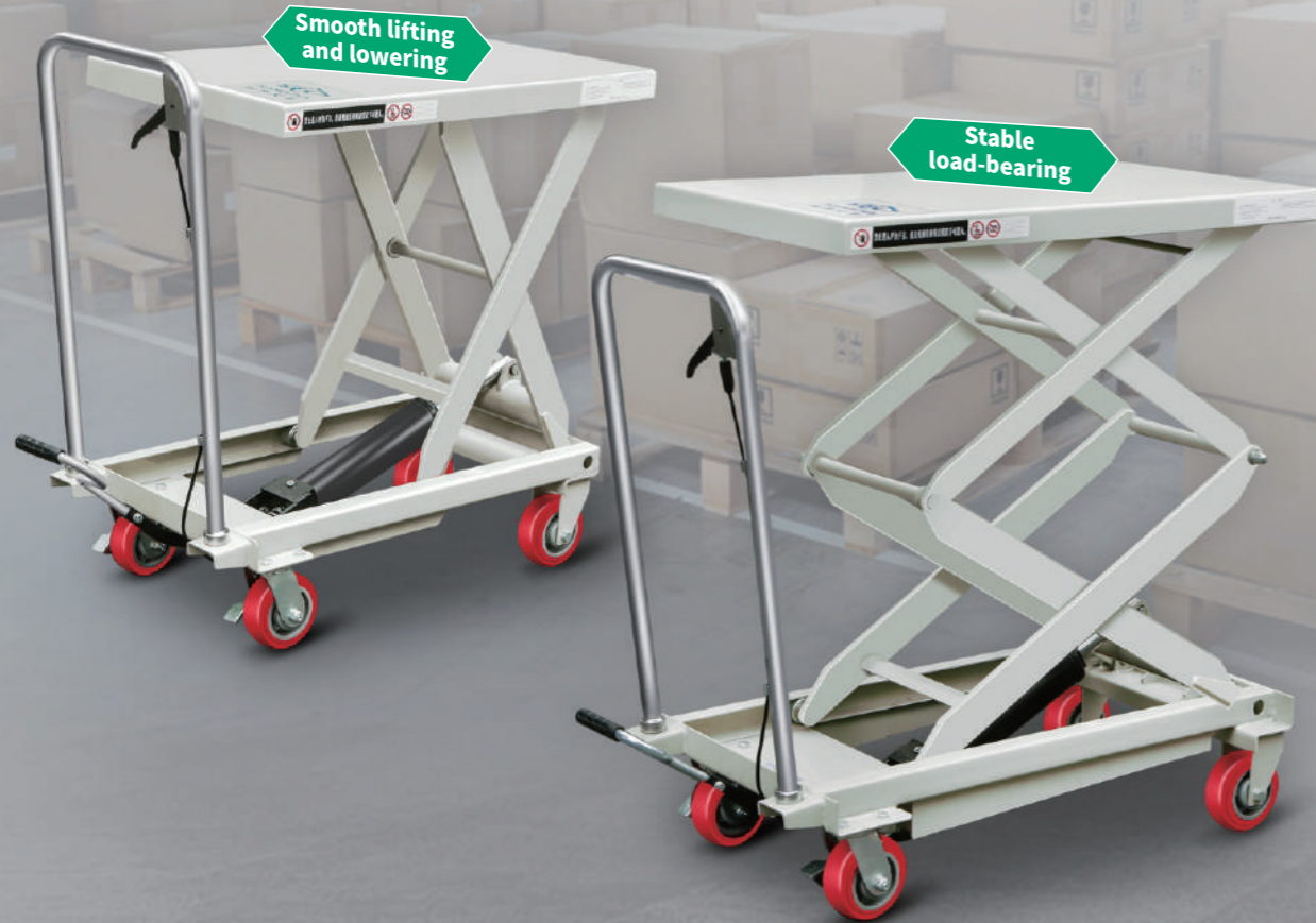
» Manual Hydraulic Platform Truck Parameter Table (Single-scissor)